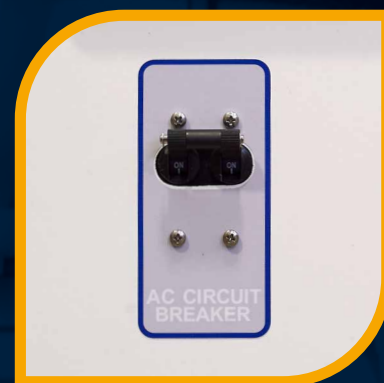
Main circuit breaker

We offer now what others will do tomorrow.